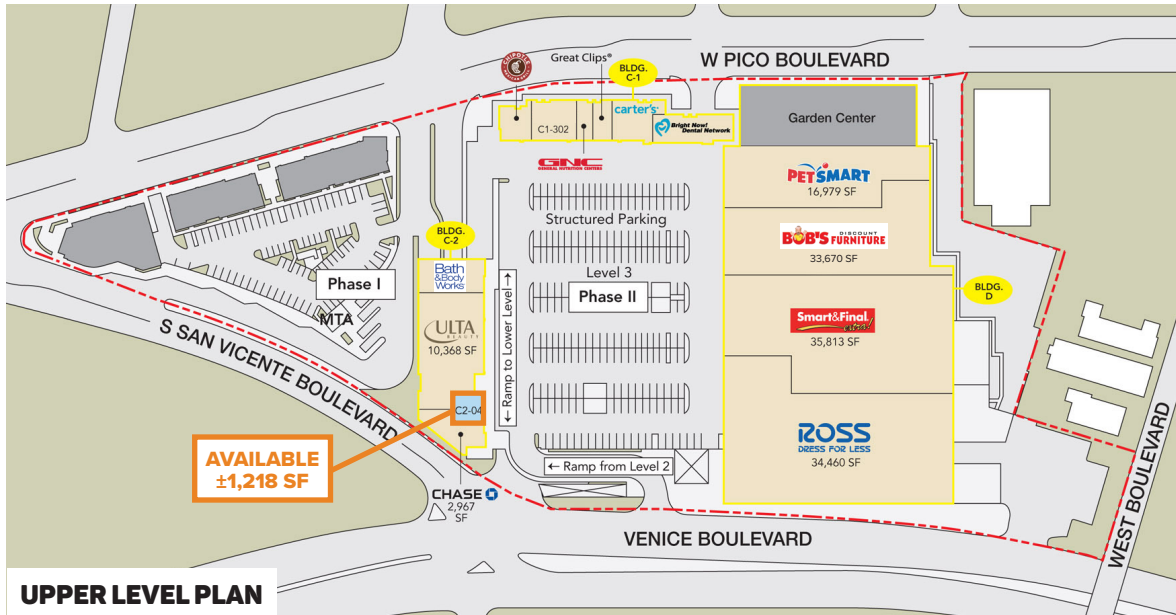
UPPER LEVEL PLAN