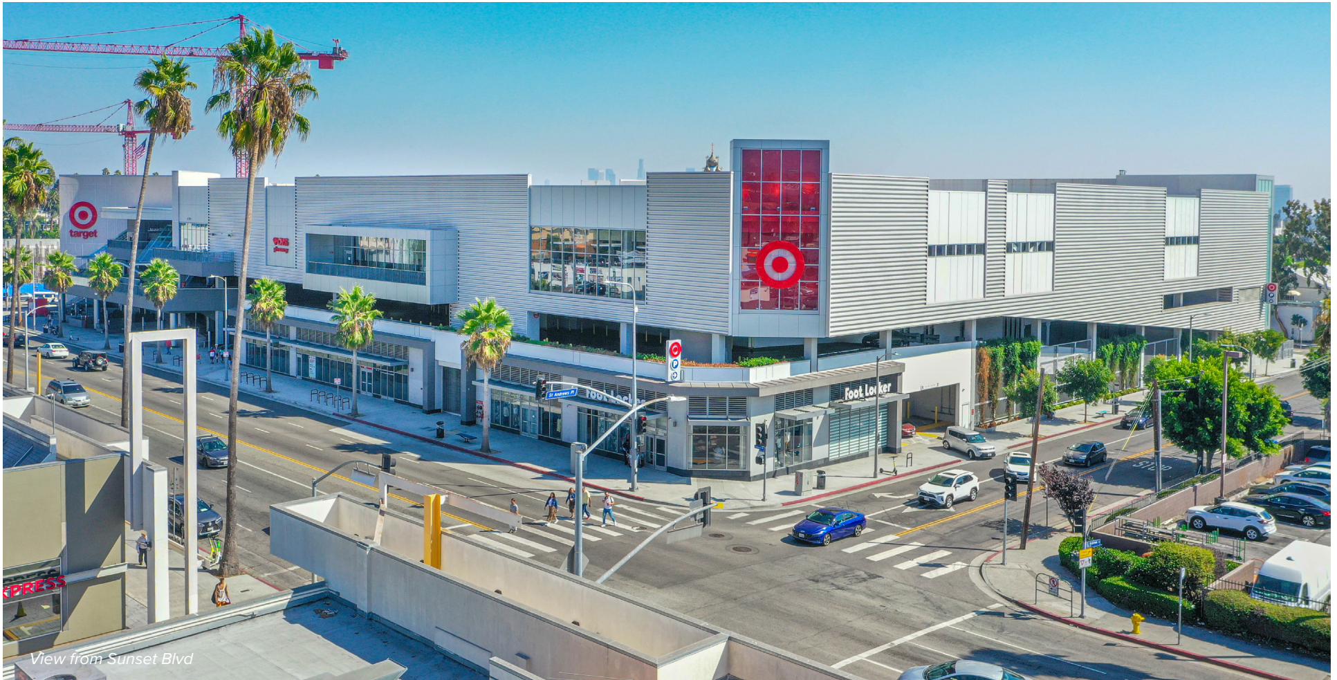
View from Sunset Blvd