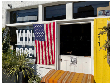
VIN ON ROSE