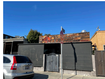
VENICE BEACH WINES