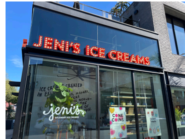
JENI'S ICE CREAM