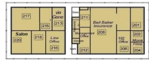
29169 UPPER LEVEL